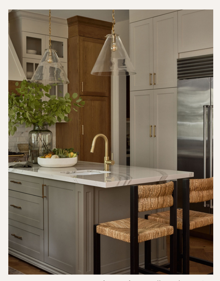
Styling Me&Mo