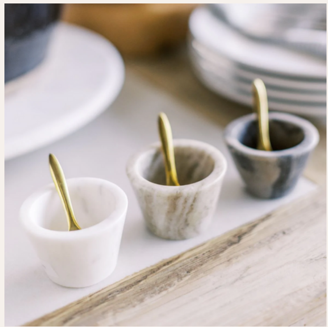
O5 Striking Salt + Pepper